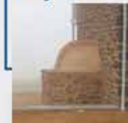
Beehive Oven at the House